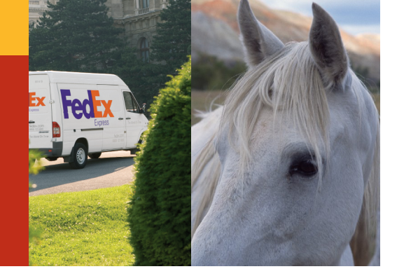
Blood, Fluids, Culture Swabs and Cytology