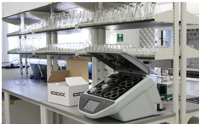
The Tecta B16 Instrument lets laboratories automate water quality testing and receive results electronically.

“It is essential that we be proactive and innovative by using the latest and greatest technology available for any potential water contamination threat,” said Person.