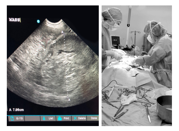
Abdominal ultrasound revealed a large (approximately 8 cm), heterogenous mass in the tail of the spleen. Thoracic radiographs were unremarkable (not shown).

Abdominal ultrasound was performed to further investigate Dale's possible splenomegaly; mild, nonregenerative anemia; and lymphocytic leukocytosis and revealed a splenic mass.