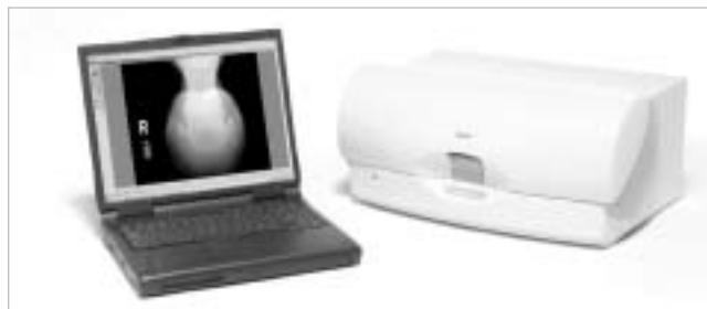
Figure 4. Mobile CR system: laptop and printer.

Human medical CR software helps optimize the