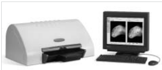
Figure 3. Computer hardware: monitor, keyboard, and printer.

new to veterinary medicine, there will likely be many new suppliers in the future. Some of them display their equipment in exhibit halls at major veterinary meetings.