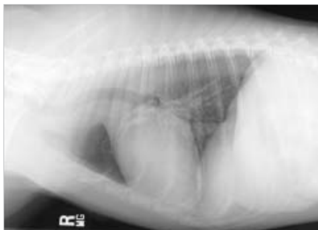
Properly exposed image of the same dog after computer manipulation.

that may not be visible with film. 1 Because x-ray film has a limited linear response, a relatively small under- or overexposure may result in an unacceptable image. 14