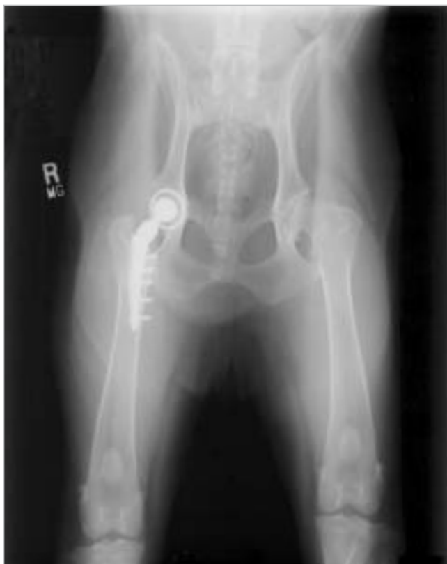
Figure 1. Comparison of a conventional film-screen radiograph and a CR film.

Conventional pelvic radiograph of a dog with a total right-hip prosthesis.